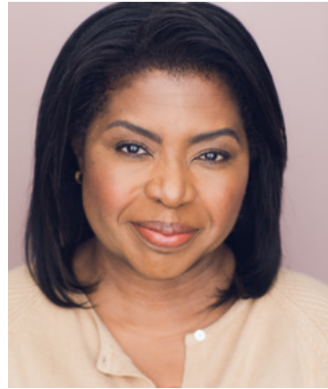
RICHARDA ABRAMS